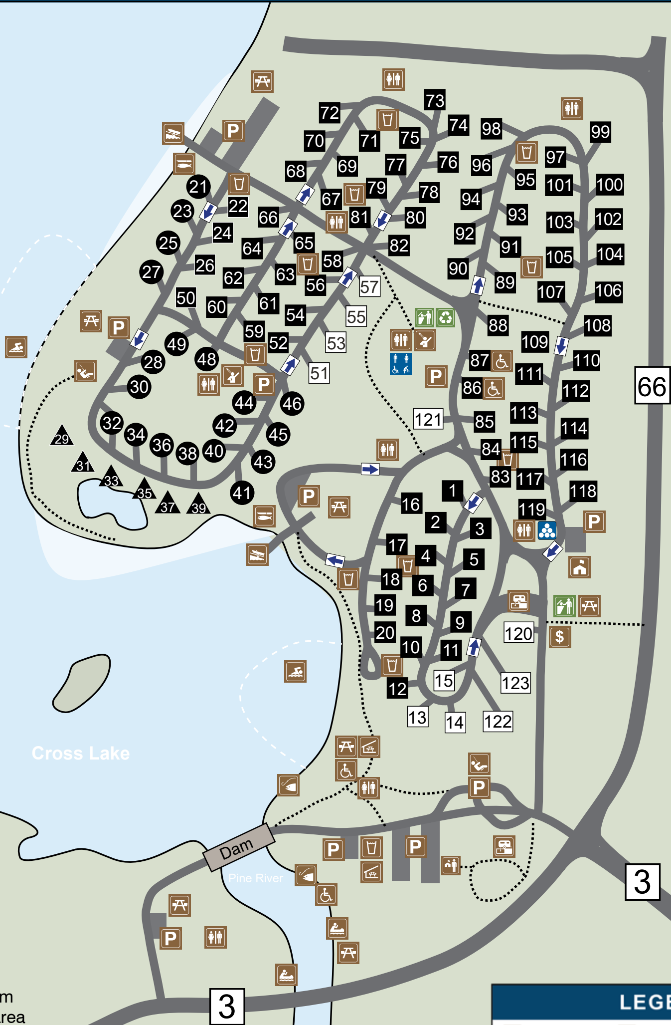
Cross Lake Dam & Recreation Area